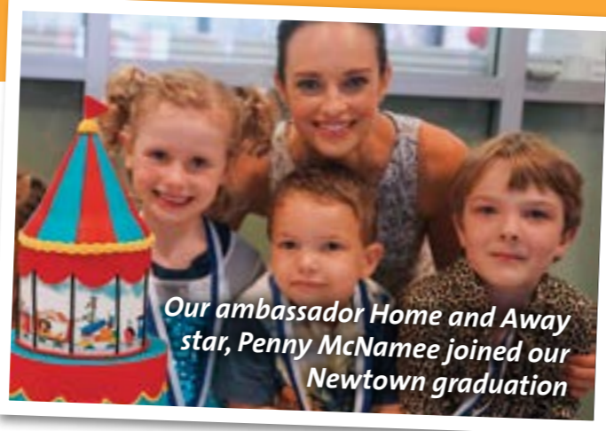
Our ambassador Home and Away star, Penny McNamee joined our Newtown graduation